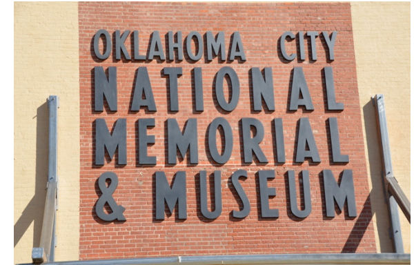
Visiting the Oklahoma City National Memorial