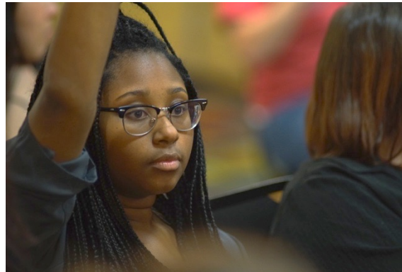
At the Capitol