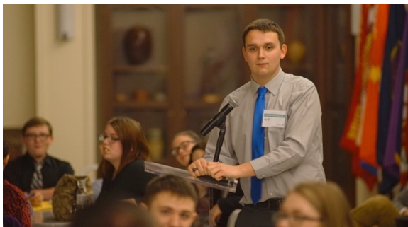
Students in the Oklahoma Judicial Center

Media (The Fourth Branch) Community Session End