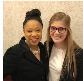
With Senator Anastasia Pittman