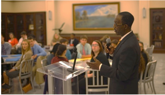
Discussion with Supreme Court Justice Tom Colbert