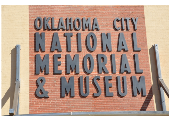
Visiting the Oklahoma City National Memorial