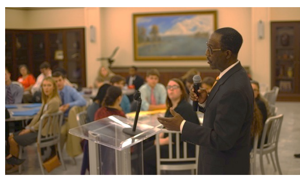
Discussion with Supreme Court Justice Tom Colbert